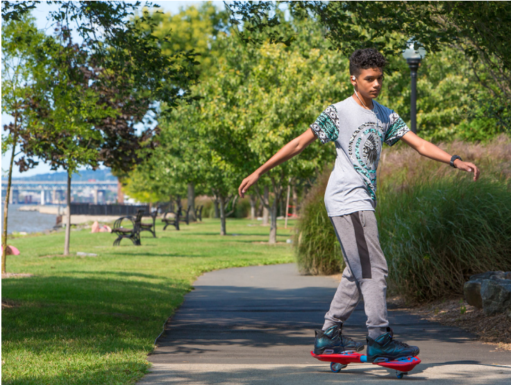
Scenic Hudson Park at Irvington