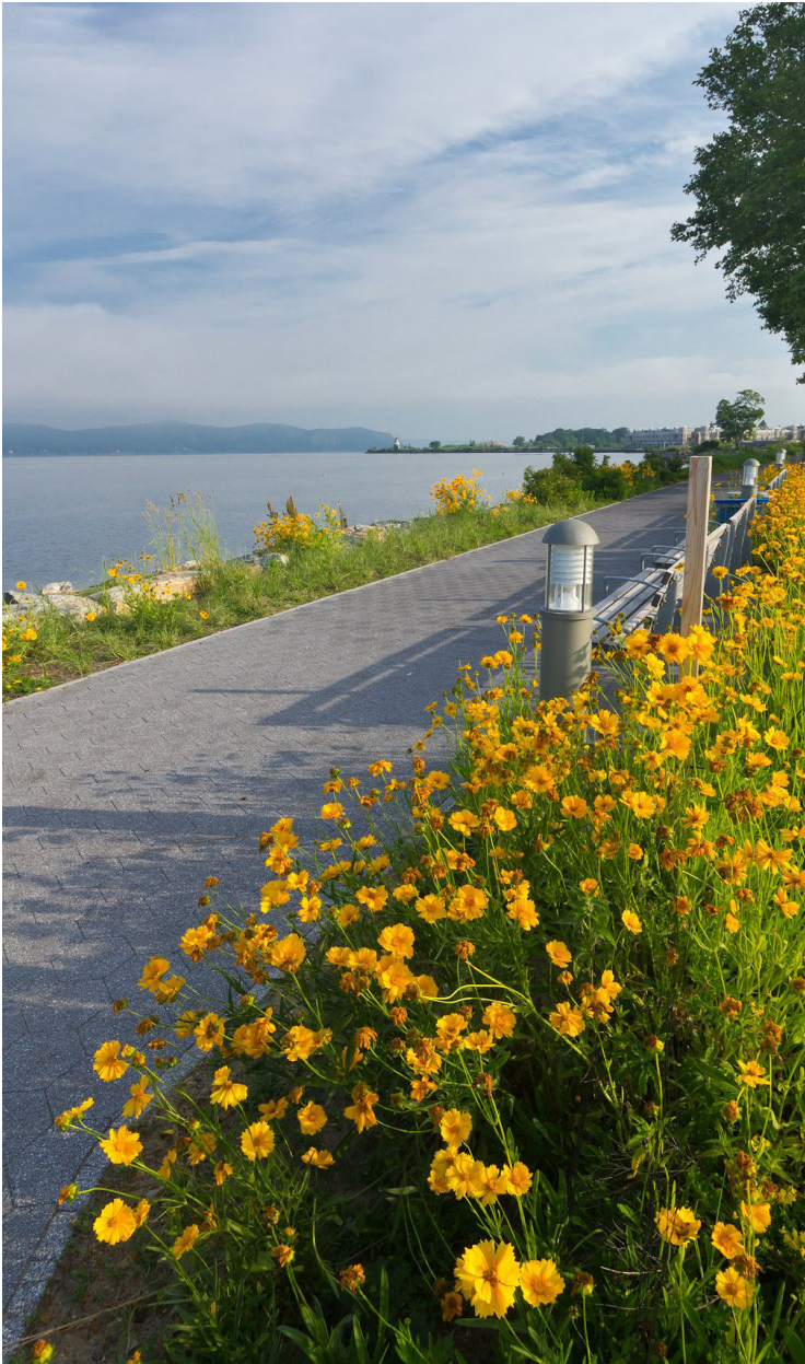
Scenic Hudson RiverWalk Park at Tarrytown