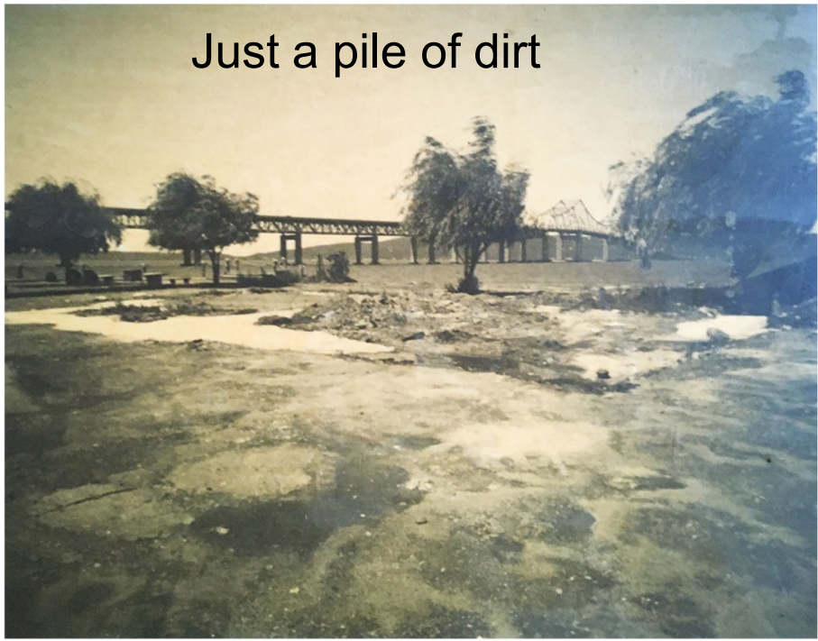
View looking Southwest