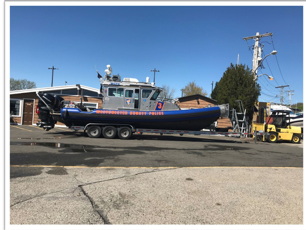
Westchester County Police Boat prep and launch at WIBC