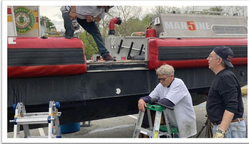
Making ready Tarrytown Fire Boat at WIBC