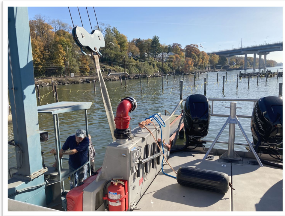
Launching Tarrytown Fire Boat at WIBC