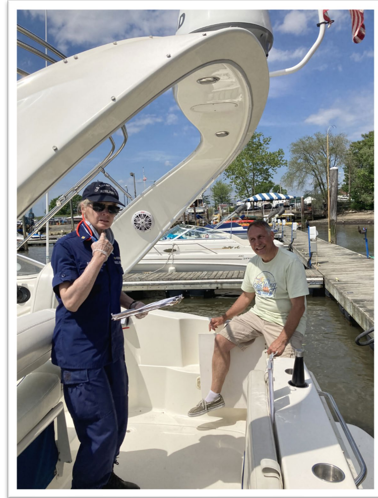
USCG Aux. Safety Inspections and Safety Education at WIBC's marina