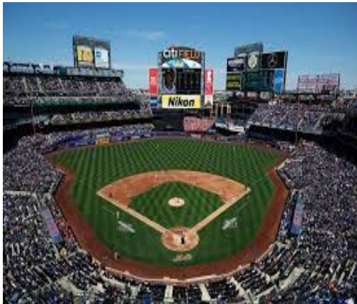
Let's Go Mets