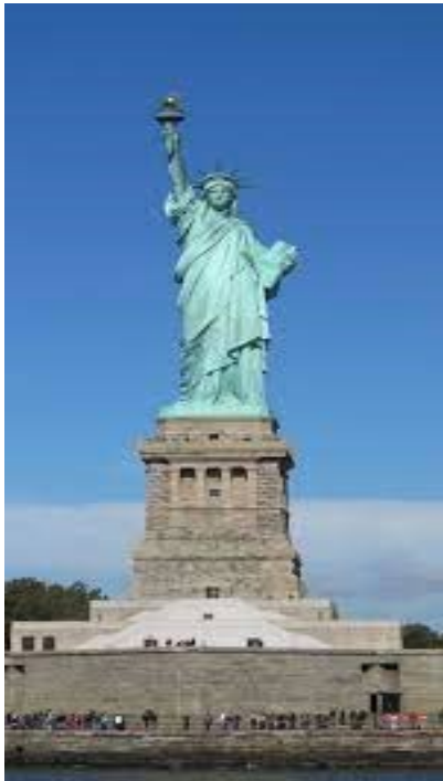
Statue of Liberty