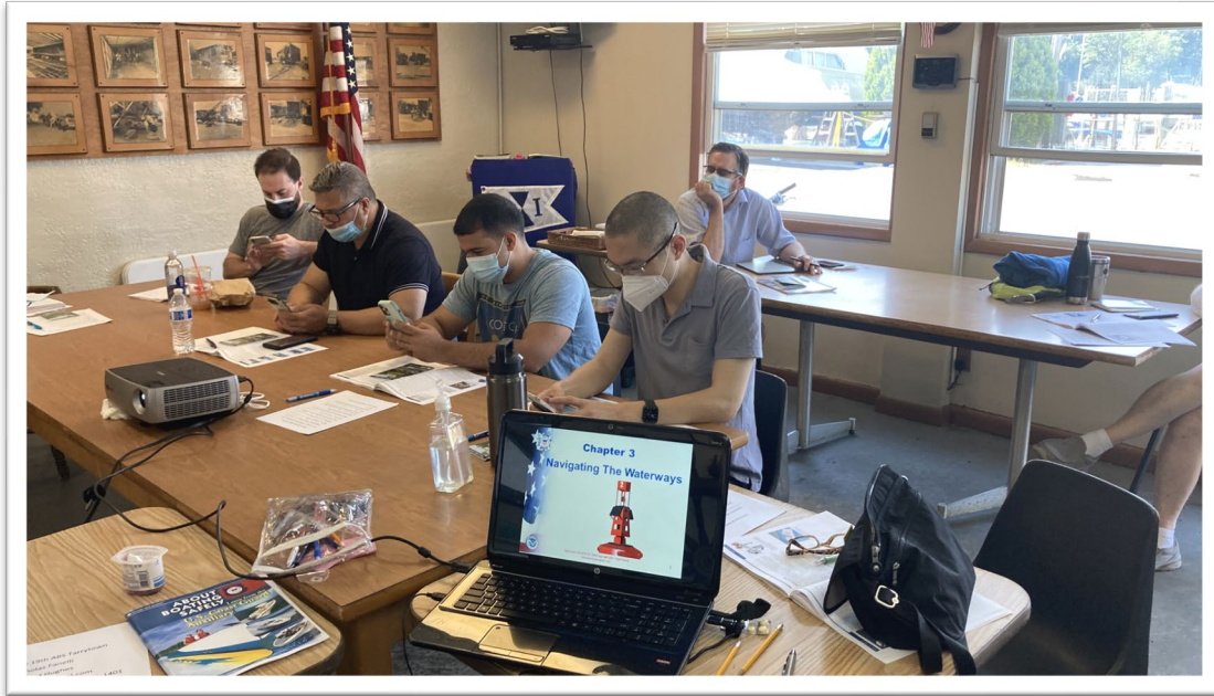
USCG Aux. Safe Boating Course Class for the public at WIBC's Quonset Hut